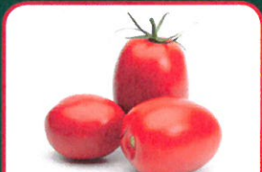
PLUM TOMATOES 99¢ LB