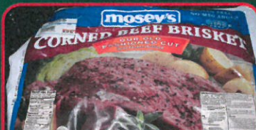
MOSEY'S CORNED BEEF BRISKET $4.99 LB. (WHILE SUPPLIES LAST)