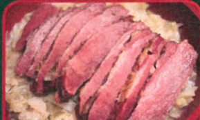
FRESH CORNED BEEF $8.99 LB.