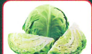
GREEN CABBAGE 49¢ LB.