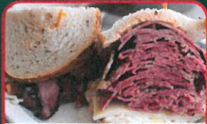
FRESH CORNED BEEF ON RYE $6.99