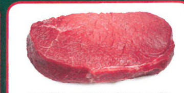
BLACK ANGUS BONELESS TOP ROUND LONDON BROIL $3.99 LB.

ALL ITEMS MAY NOT BE EXACTLY AS THEY ARE REPRESENTED IN PHOTOGRAPHS. THEY ARE JUST REPRESENTATIONS OF ACTUAL SALE ITEMS.