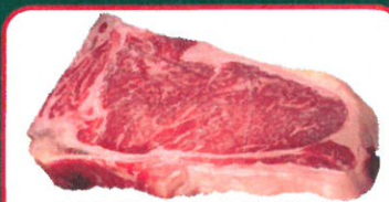
BLACK ANGUS BONE IN SHELL STEAKS $7.99 LB.