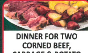
DINNER FOR TWO CORNED BEEF, CABBAGE & POTATO $24.99 W/COMPLIMENTARY LOAF OF IRISH SODA BREAD