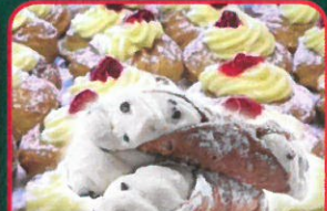
FRESH CANNOLI & ST JOSEPH'S PASTRIES