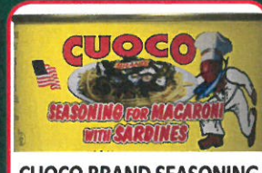
CUOCO BRAND SEASONING for MACARONI with SARDINES $3.99 8 1/2 oz CAN