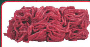
FRESH GROUND SIRLOIN CHOP MEAT $2.99 LB.