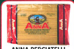
ANNA PERCIATELLI #15 PASTA $1.49 1 LB BAG