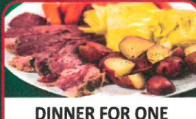
DINNER FOR ONE CORNED BEEF, CABBAGE & POTATO $14.99